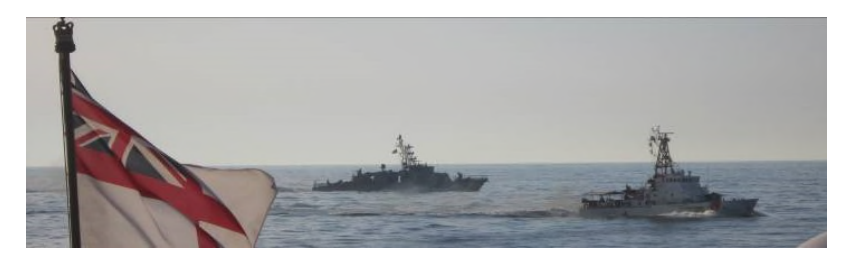
CHIDDINGFOLD working with USCG MAUI & USS HURRICANE.