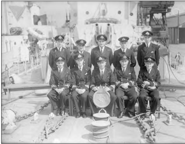
THE CREW MAKE THE SHIP. The officers of HMS CHIDDINGFOLD in May 1945, and below the current crew in July 2016.

doubt see lots of friendly faces. However for many of us we leave the crew to start our next jobs, thanks again for helping us achieve so much and have fun throughout.