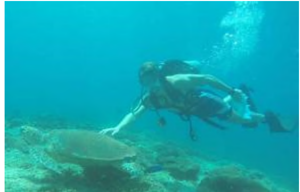
Photo (right): AB(Diver) '???' '?????' diving at the Daymaniat Islands which are rich with sea life including turtles and whale sharks.

Sailors from both CHID and PENZANCE were able to enjoy a break from normal duties and participate in a range of Adventurous Training activities organised by visiting Royal Navy instructors in Oman. The country is renowned for its watersports and, in the heat of summer being in or on the water is the best place to be!