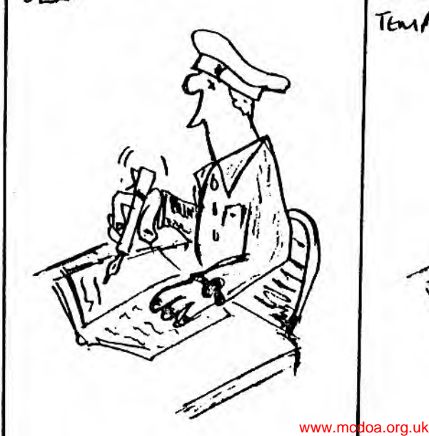
IT DEALS OUT DEATH & DESTRUCTION GLAM ITS